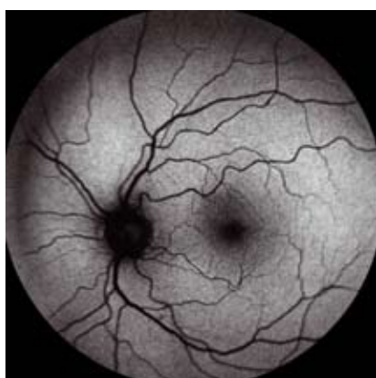
Figure 1: Fundus autofluorescence mean image of a 66-year-old male patient with normal topographic distribution of autofluorescence intensity. Absorption by retinal vessels and by macular pigment results in decreased autofluorescence signal intensity.

Non-invasive methods are increasingly used to diagnose and treat various retinal diseases. Besides optical coherence tomography (OCT), one of the major methods of such analysis is through confocal laser scanning ophthalmoscope (cSLO), which can record in the autofluorescence mode a complex signal predominantly derived from autofluorescent lipofuscin granules in the retinal pigment epithelium (RPE). This method allows one to record fundus autofluorescence intensity and distribution in vivo.